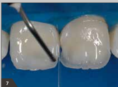
7 Forming the incisal edges with the highly translucent Amaris Flow HT