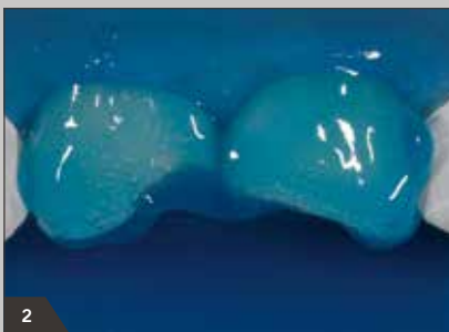
2 Conditioning the tooth substance with 37 % phosphoric acid