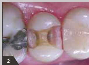
2 Situation after removal of the filling and complete excavation