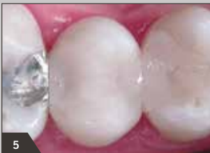
5 Finished, polished restoration