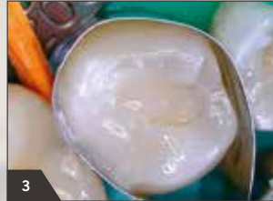
3 Opaque dentine base layer applied in increments