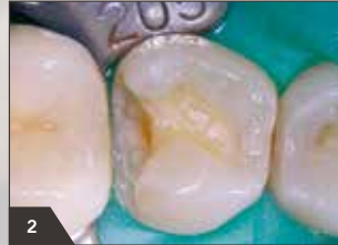
2 Placement of rubber dam and removal of remaining amalgam. Situation after complete excavation