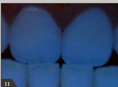
11 Fluorescence like with natural teeth