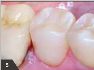
5 Finished, polished restoration (vestibular view)