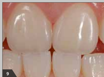
9 Completed anterior restoration