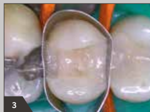
3 Incremental layers of opaque dentine base shade