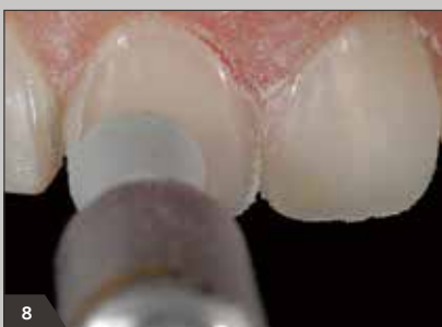
8 High gloss polish of the restoration