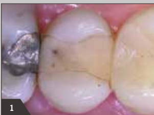
1 Insufficient mod composite restoration in tooth 25