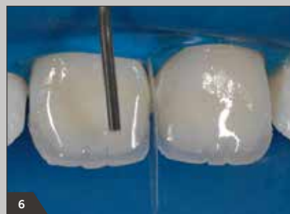
6 Creating mamelons with a natural appearance through light pigmentation with Amaris Flow HO