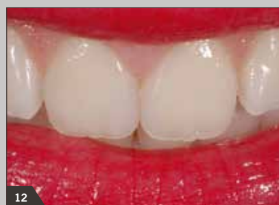
12 Anterior restorations indistinguishable from the natural teeth