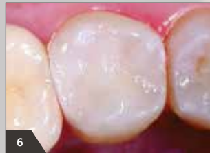
6 Finished restoration from occlusal view