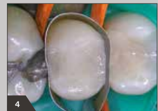
4 Final layer with translucent enamel shade