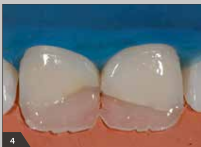
4 Application of Amaris TL to reconstruct the palatal enamel portion