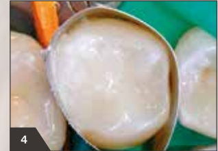
4 Final layer with translucent enamel shade