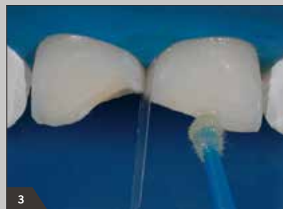
3 Application of the adhesive