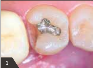
1 Fractured occlusal distal amalgam filling in tooth 45