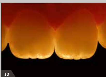
10 Natural opalescence and translucency of the restorations