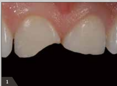
1 Initial situation: incisal fracture in teeth 11 and 21