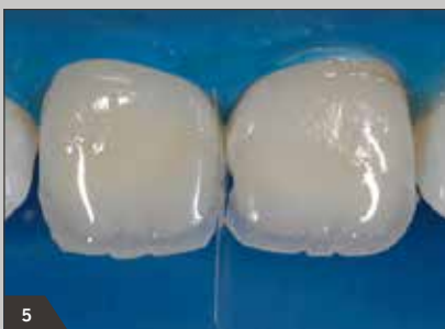
5 Modelling the dentine and mamelons with Amaris O1